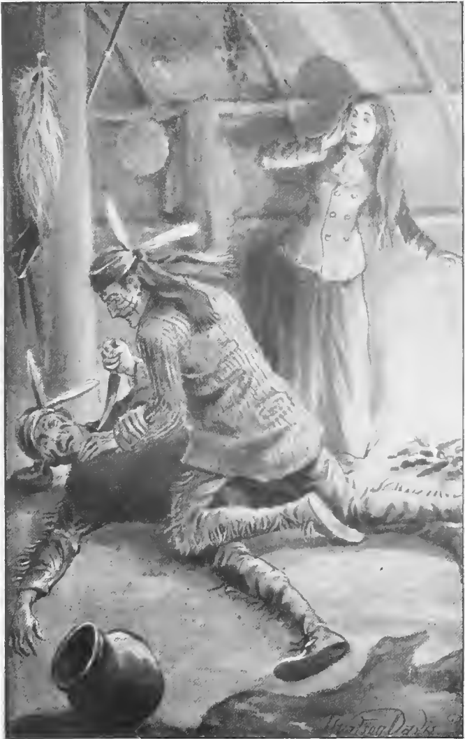
In an instant Braxley lay upon his back on the floor, a knee upon his breast, a knife at his throat. Page 312.